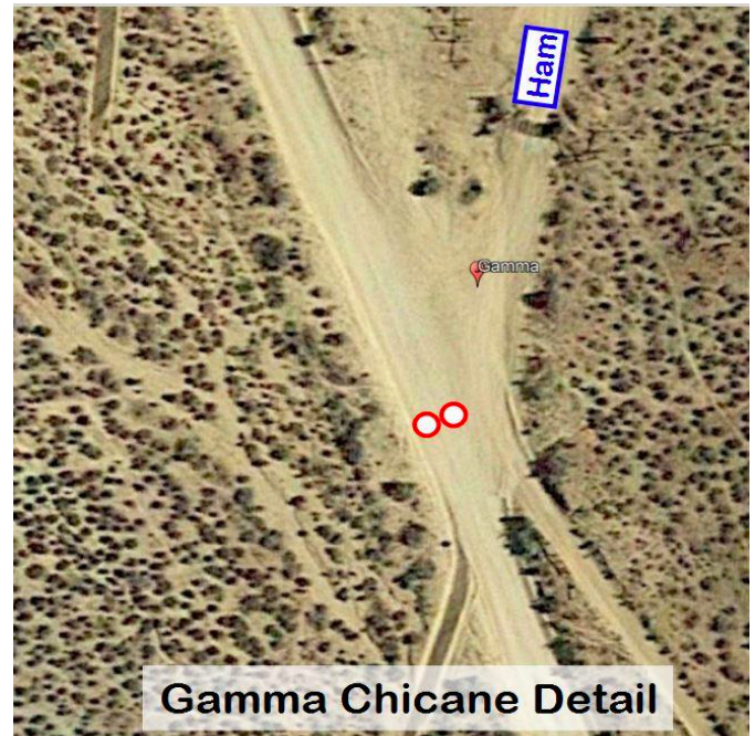
Gamma Chicane Detail

The first chicane is at coordinate 35.37255, -118.11677. This is at the north intersection where Butterbredt and Jawbone Cyn meet. The chicane will be a single element chicane that forces cars to use the intersection as a delta. When running Jawbone Cyn N (SS1), Oakbone W (SS5), Onyx N (SS7) the entrance to the chicane will be on the RIGHT. When running Jawbone Cyn S (SS4), Aila Sweet Tooth (SS6), Onyx S (SS11) the entrance will be on the LEFT.